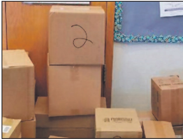
Some of the supplies provided by the RBC grant.